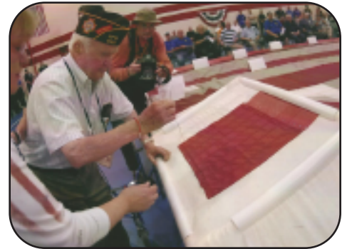
Lion Sam was selected to "stitch" the 9/11 flag touring the United States.