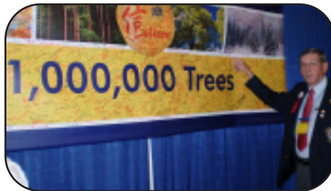
IP Wing Kun Tam's goal is to plant 1,000,000 trees around the world. DG Dave pledged 1,000 trees for District I. DG Dave says "I believe "working together" we can do this."