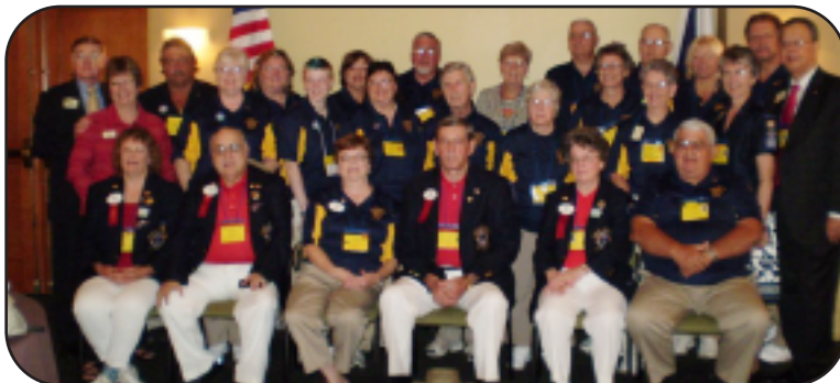
WV Delegation at International Convention.