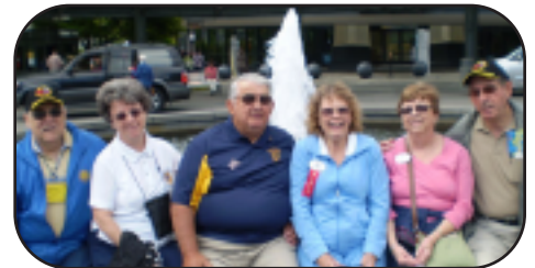
MD 29 DG's and spouses