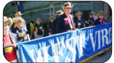
WV Lions at International Parade